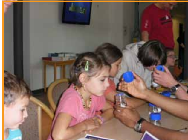
Guessing different aromas.