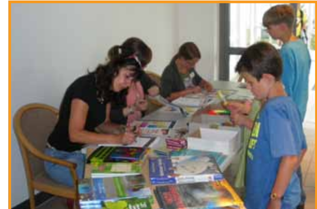
Many prizes for the young researchers.

The event attracted great interest from the media. Both the Mitteldeutsche Zeitung and the radio station mdr info made interesting contributions on Saturday 2 July.