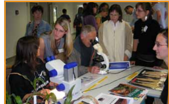
Mycorrhizal roots under the microscope.