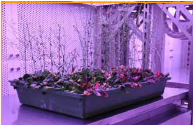
The model plant Arabidopsis thaliana in the plant growth chamber.

On 6 May 2011, Germany's most modern phytochamber facility was inaugurated. It contains eight accessible plant growing chambers, two of them equipped with high performance LED technology.