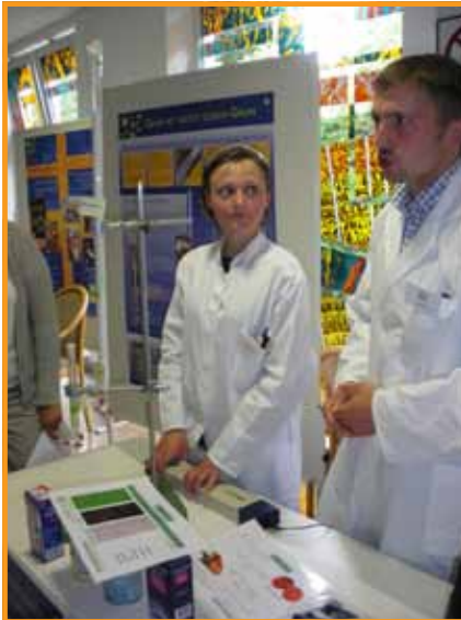
Members of the department NWC explain the principle of the chromatographic separation of plant extracts.