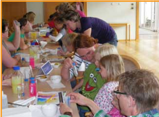
The Street of experiments : filling up tip boxes and DNA-Isolation from bananas.

Very popular for the children was the Street of experiments , which gives access to scientific topics in a playful manner to young researchers. For the adults there were guided tours through the greenhouse and demons-